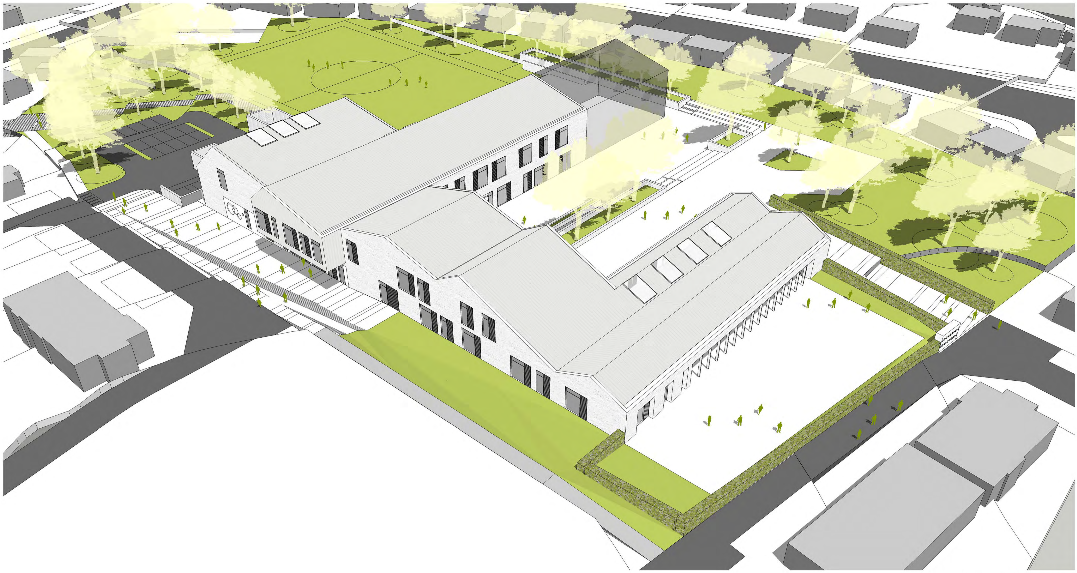
Indicative Aerial View