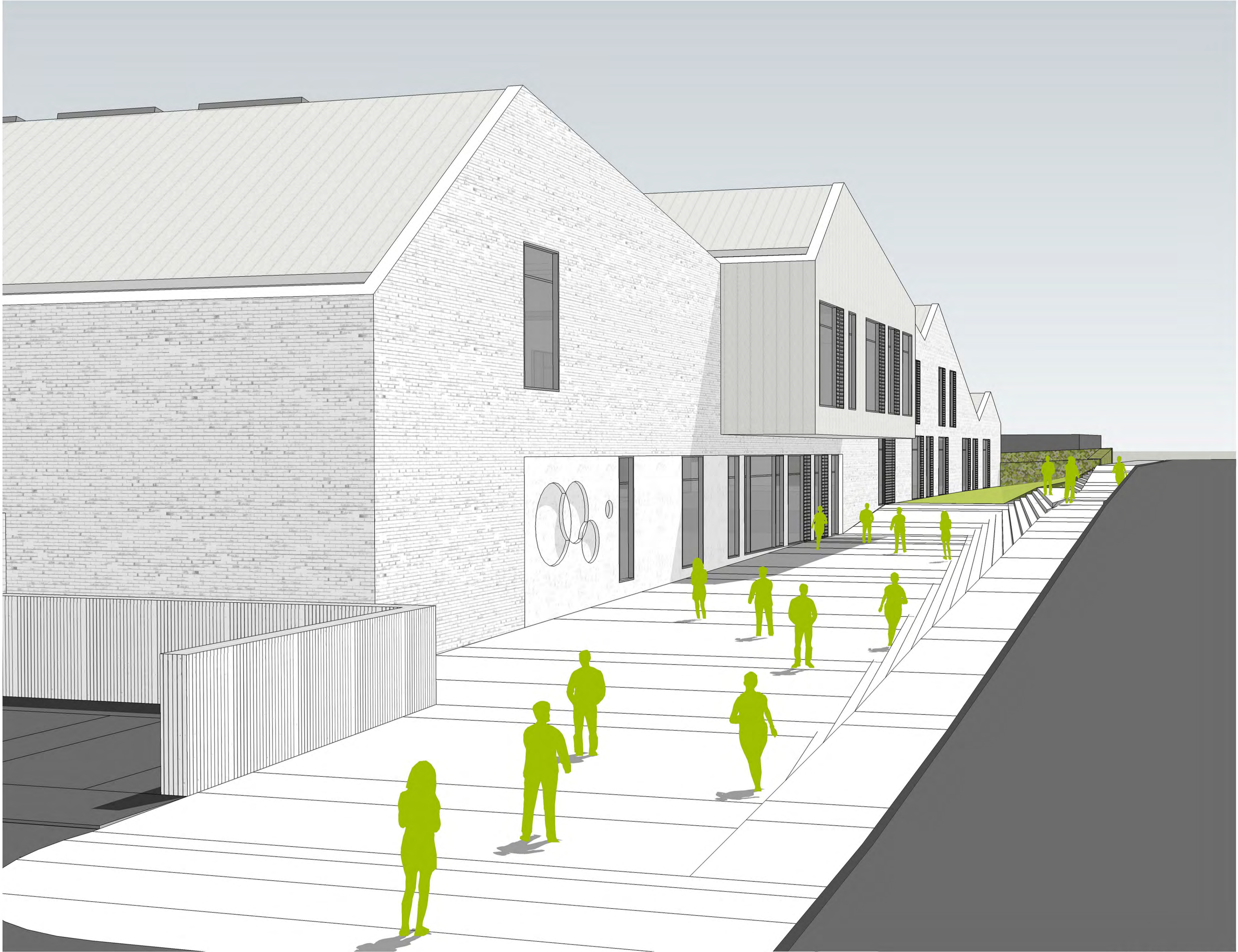
Main Entrance View