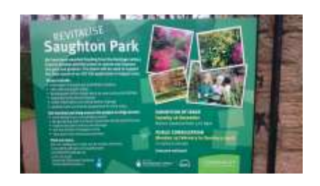
New Information Signs

The exhibition itself received a lot of press coverage, which is great and hopefully it has raised awareness even further ready for our major public consultation next March, when we want local and city wide residents to get involved and have their say about what's being proposed for the park.