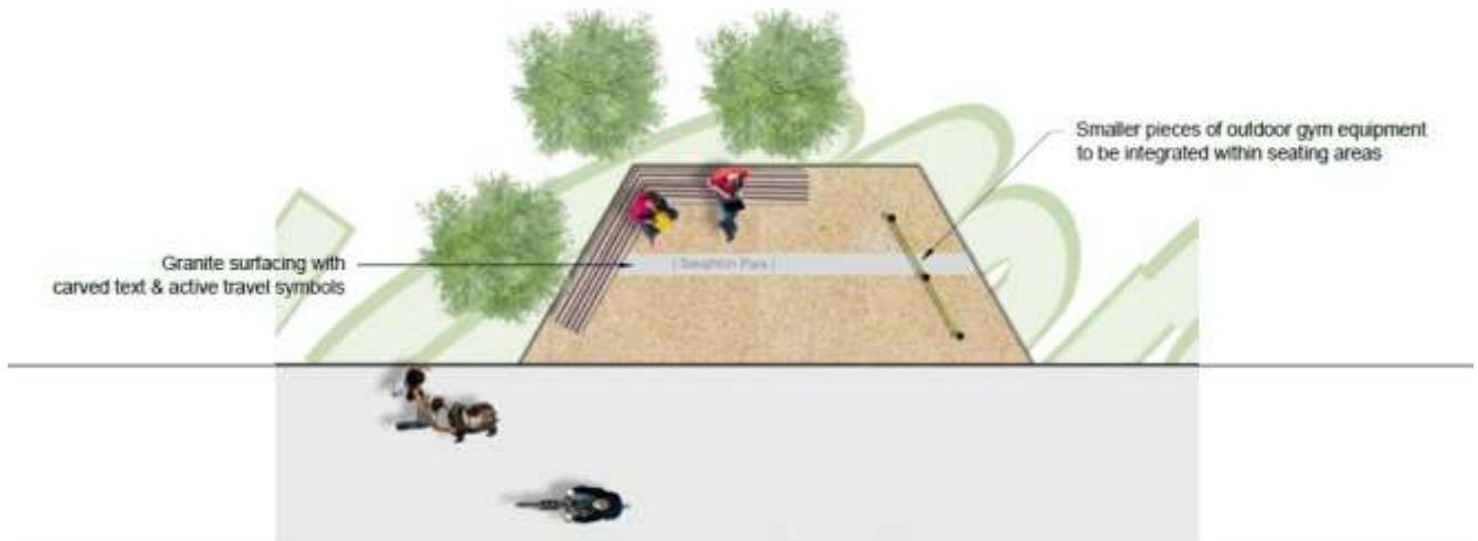
New seating areas around the 'Active Travel Routes'.

We have developed detailed designs for a network of off-road green Active Travel routes running through the park. This design work is being funded by a Sustrans Community Links grant, and the plans will be used to support another funding application to the Sustrans Community Links fund to carry out the works. There is already HLF funding secured to develop this network of paths; however additional Sustrans funding will allow us to widen the paths to allow pedestrian and cycle traffic and so help to increase the number of 'Quiet Routes' which run across Edinburgh. Seating areas will be incorporated around the whole path network, some with fitness trail equipment to complement the outdoor gym area. The designs will be available to view on our website www.edinburgh.gov.uk/saughtonpark and in the Winter Garden from Monday 16 January.