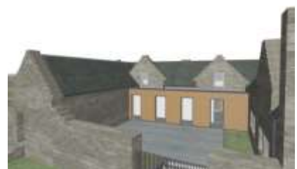
New corridor for the Chapel.

The new veranda leading to the refurbished Chapel which will provide a new community and volunteer venue and office space for staff and the Caley.