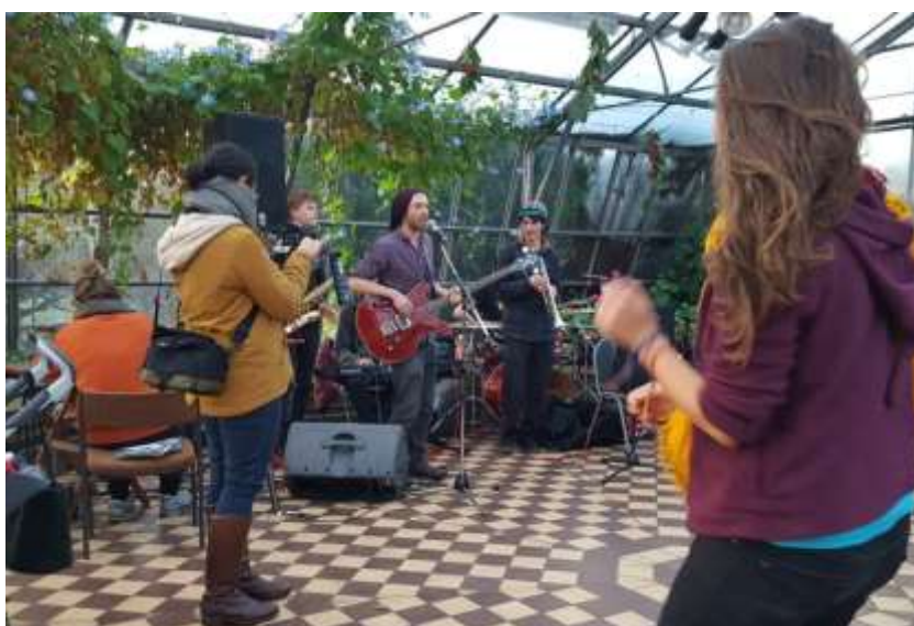
Dancing to soul funk hip-hop fusion exponents 'Jambouree'.

We hope to host Disco Soup at Saughton again in March, so watch this space.