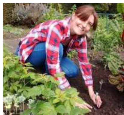
Working in the Community Garden.

Or just come along to the next Friends meeting.