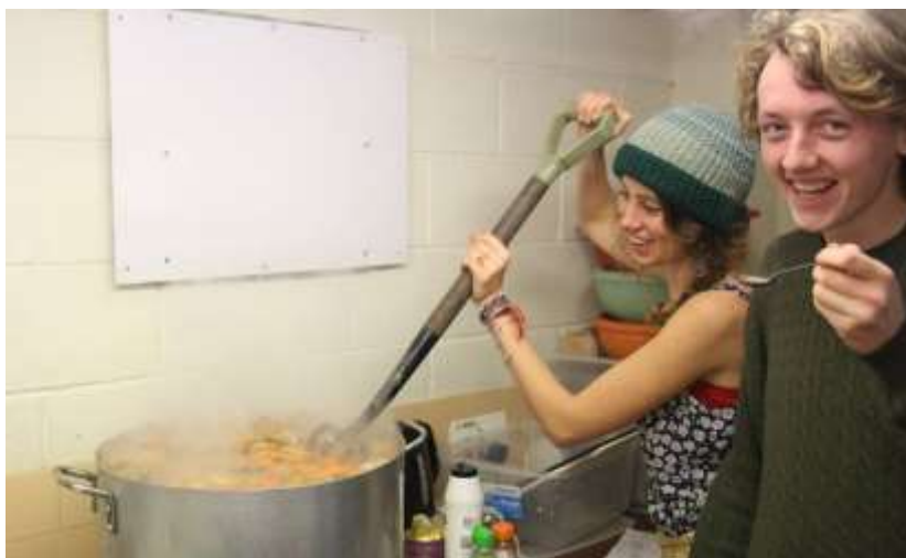
Stirring the soup with a garden fork and why not!

Sunday 4 December, following the Christmas Event, we continued the busy weekend with around 200 people attending our first 'Disco Soup' organised by Food Sharing Edinburgh who are funded by the Scottish Climate Challenge Fund to reduce CO2 emissions. They achieve this by gathering food which is perfectly good but which might otherwise be destined for landfill and then sharing it with everyone. Disco Soup brings people together to chop and grate veggies and make gorgeous homemade soup and whilst it's all bubbling away, dance to live music.