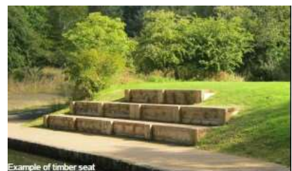
Timber seating for spectators at the games area.

The new outdoor gym will be located to the west of the playground, next to the games area. We have some funding secured through the HLF bid and we will be trying to raise additional funding to increase the amount of the outdoor gym equipment. If the additional funding can be raised, we will have a 'spin zone' with various bikes and a toning zone.