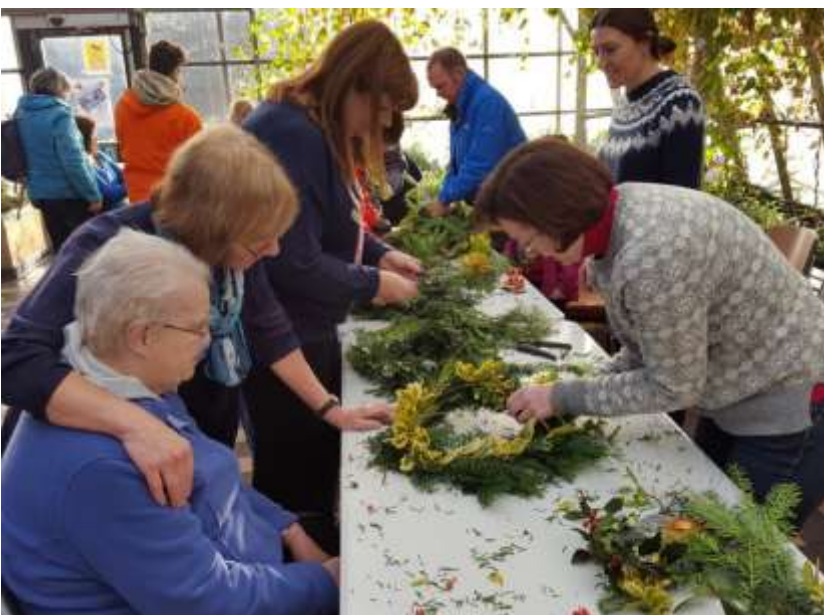
Christmas wreath-making with the Friends of Saughton Park.