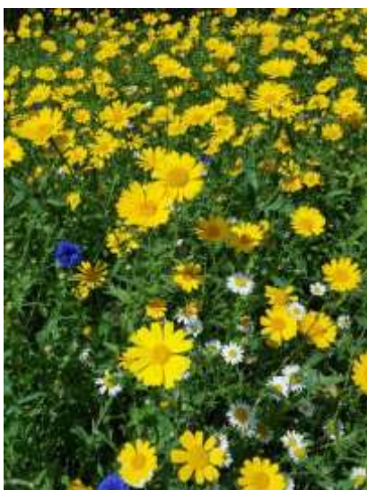
From tiny seeds grew these lovely wildflowers.