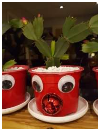
Rudolf the Red Nosed Cactus, just one of the great Christmas themed things for sale at the event.