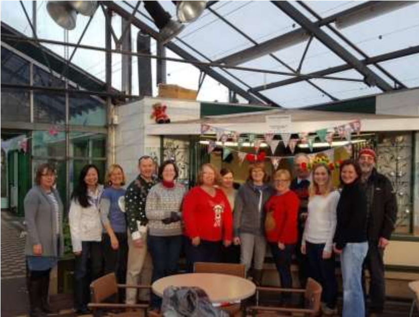
Friends of Saughton Park in festive mood!

The FoSP AGM held in November was very well attended and as usual this was a great mix of the fun and the formal. The existing committee was unanimously re-elected and one new committee member was welcomed to the team. The year ahead was planned and everyone was very excited about the restoration works starting in the summer.