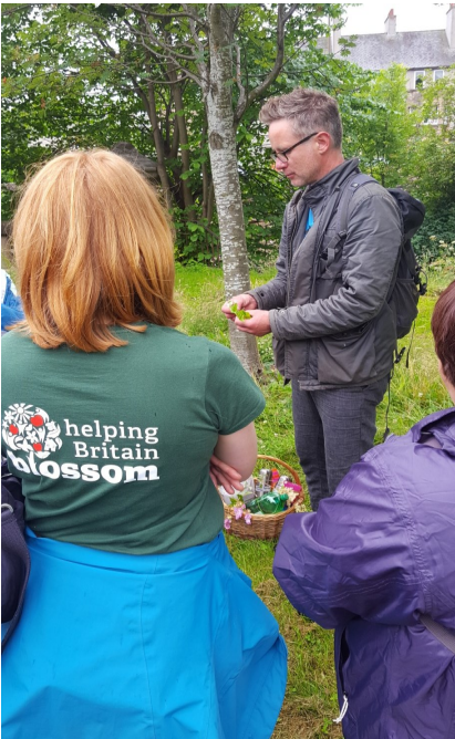
Plantain as a cure for bee stings.