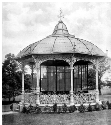
The original 1910 catalogue illustration of the Lion Foundry No.23 bandstand