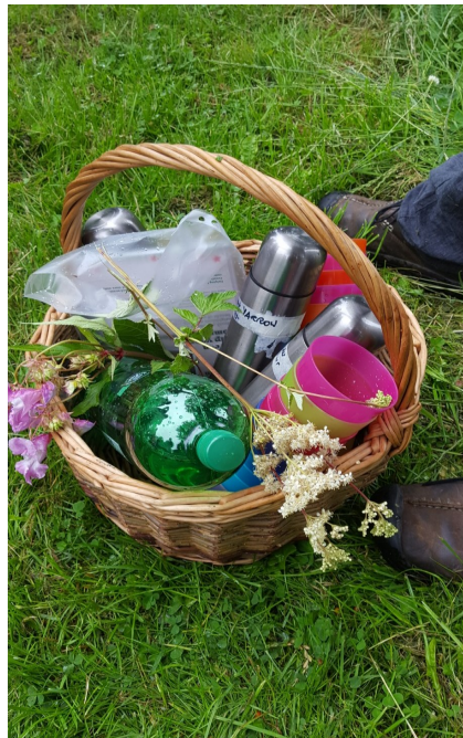
Samples of wild flower infusions.