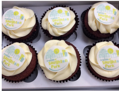
FoSP cakes! Amazing!

At the Garden Party there was the now legendary FoSP pop up café with cakes to die for and The Syrian Kitchen brought an exotic touch with their wonderful array of Syrian foods.