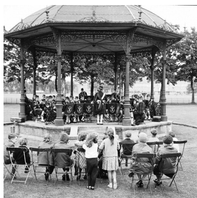
Our bandstand in action back in the day.