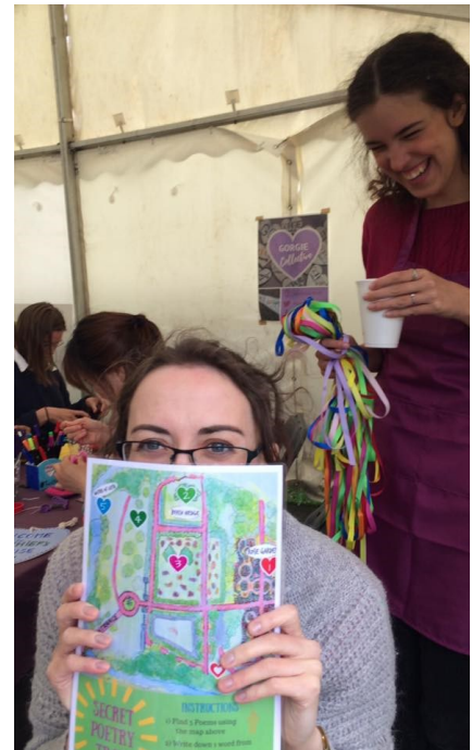
Music, food, fun and laughter were the order of the day!

Over the next year the FoSP will continue to be highly involved in the project and will run events when the construction work allows.