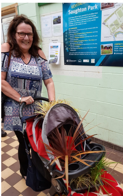
The plant sale was popular.