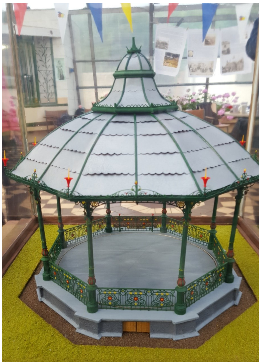
Joe's stunning 1:32 scale model of the Lion Foundry No.23 Bandstand which used to stand in the west car park of Saughton Park near Ford's Road.

If you are interested in finding out more, contact Joe via friendsofsaughtonpark@gmail.com .