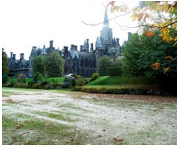
Lawn below Headmaster's garden