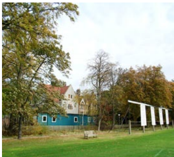
Belows playfield field and Malcolm House