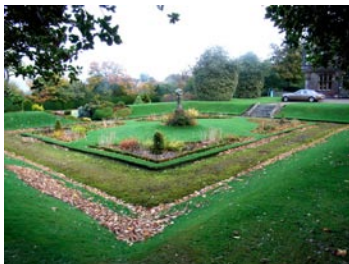
Sunken garden by Headmaster's lodge