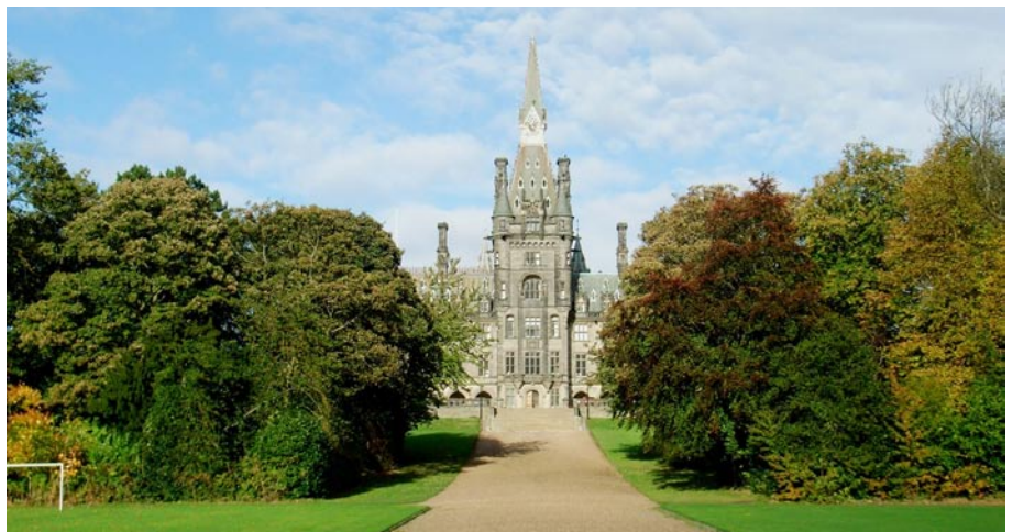
Broad Walk from South Gate

Fettes College stands in a broadly rectangular site on rising ground to the north of the Water of Leith. Its landscaped grounds are defined to the west by Crewe Road South, to the south by Carrington Road and to the east by East Fettes Avenue. Young's Playing Fields to the north are separated from the Belows Playing Fields and main school campus by the 1980s residential developments of Rocheid Park and North Werber, and by neighbouring campus of Telford College. The main vehicle access is from East Fettes Avenue, with subsidiary vehicle entrances adjacent to Rocheid Park, serving the North Lodge, Malcolm House and the Preparatory School, and on Crewe Road South serving staff houses and