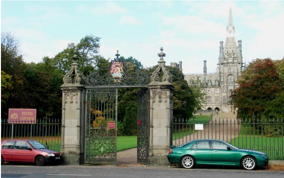
South Gate and approach