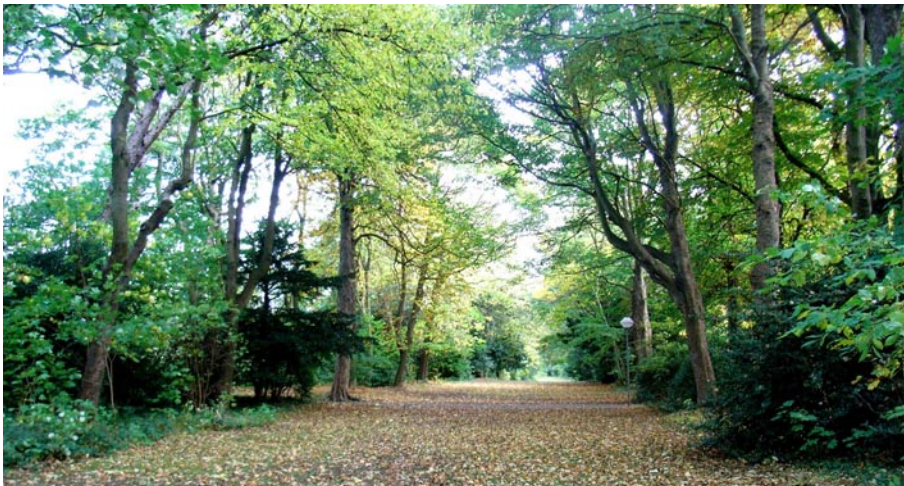
Green Walk, South Wood