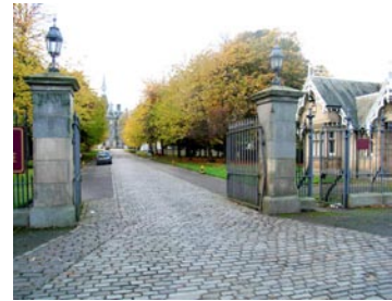
East Gate and Lodge

The more westerly and southerly parts of the landscape were planted with a broad belt of mixed woodland, cut through by a broad grass ride known as the Green Walk. The species mix, which owes much to James McNab, is described as follows.