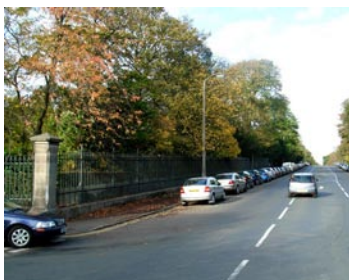
Boundary woods, Fettes Avenue