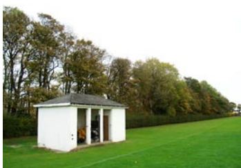
Young's playfield field and Ferry Road woodland strip