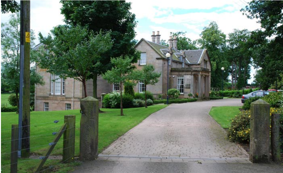
Kellerstain House from east

Machine to the north-west, although in this case a third eastern field is also enclosed by tree belts. A small lodge lies to the north-east at the end of a short drive. Modern maps and aerial photographs show that this arrangement has survived with the addition of a large house in the walled garden and another to its south.