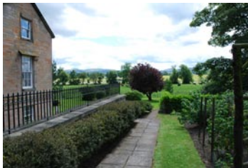
View over garden to Pentland Hills