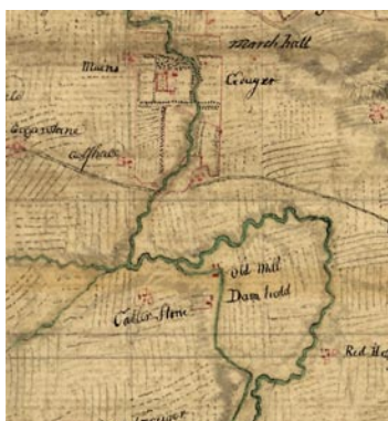
Roy's Military Survey c1750

Appears on Roy's map (c1750) as Caller Stone as a group of buildings like a farmtoun. Sharp, Greenwood & Fowler (1828) show a house called Callerstone in the eastern of two tree-belted enclosures with a walled garden to its south-west. The same basic arrangement is seen on the six-inch 1st edition OS map where a small house, now named Kellerstain, stands in parkland with a square quartered walled garden and a courtyard of farm buildings with a Threshing