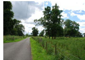
Drive through parkland