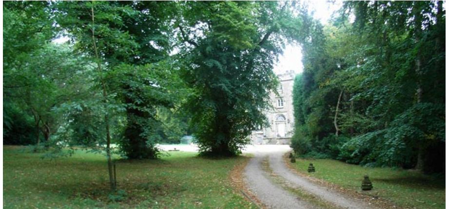
Approach to Woodhall House with mature limes