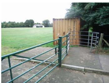
Campbell Park entrance

The steep slope between Juniper Green and the Water of Leith is characterised by mixed broadleaved woodland, much of it self-seeded, but likely to be derived from earlier planting of the north half of the Woodhall estate. Within the riverside woodland are substantial traces of the mills that used to stand on this side of the river, together with access roads and paths. The site of Woodhall Mill (now demolished) is occupied by a substantial dump of rubble and other demolition material.