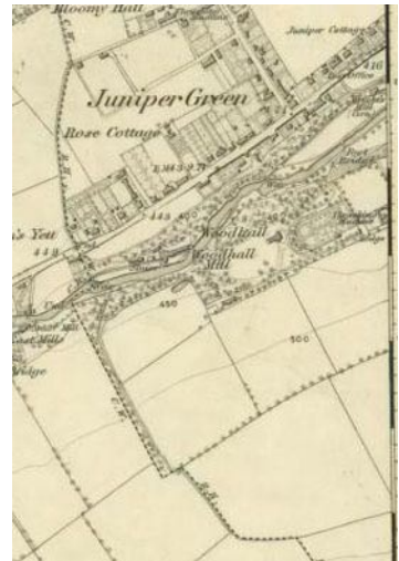
Ordnance Survey 6" map 1852