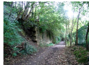
Water of Leith walkway and cyclepath

There has been a small amount of ornamental planting around the edges of Campbell Park. In spite of this the park, especially the children's play area, feels rather bleak and exposed. Consideration could be given to augmenting the planting and upgrading the visitor/user facilities, to make the park more attractive.