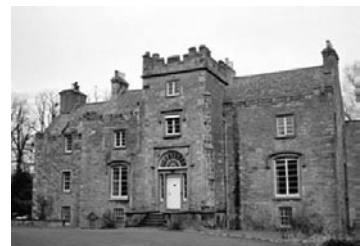
Woodhall House, 1975-76 (RCAHMS)