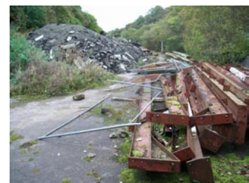
Stored demolition materials