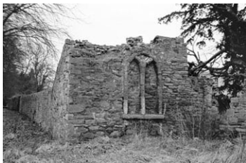
Dovecot, 1975-76

On the steep slope of the Water of Leith to the north of the mansion house is a substantial area of mixed broadleaved woodland, with a high proportion of beech, sycamore and lime. This screens the house from Juniper Green and the public footpath on the north bank of the Water of Leith.