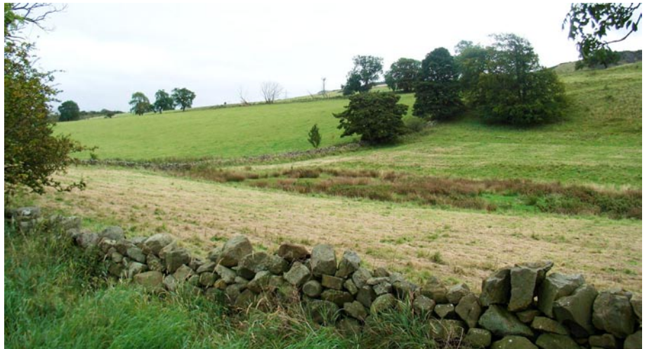
South Park walls and planting