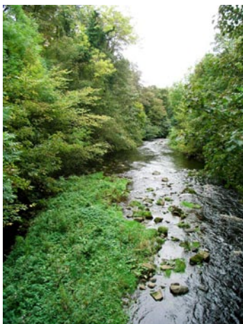
The Water of Leith