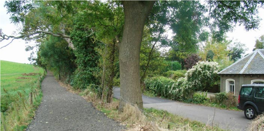
Woodhall Lodge and public footpath