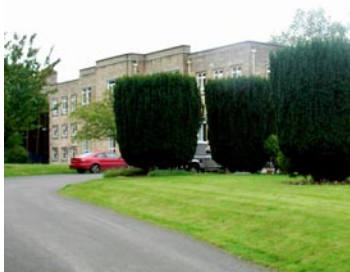
Woodhall Court and Irish yews

Substantial traces remain of the walled and tree-lined grazing parks to the south of Woodhall House on the north slope of Torphin Hill, seen on Roy's map. The pattern is traceable in the form of stone walls, now decayed and fragmentary, and in the pattern of surviving mature trees.