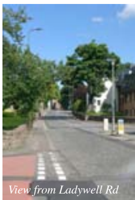
View from Ladywell Rd

There are four main approaches to Corstorphine's historic core. From the west past more recent developments Ladywell Road undulates up and down until it rises up again onto the ridge on which the village core stands. Similarly from the south Saughton Road North rises up the slope created by the draining of the loch. The other accesses conversely come down from St. John's Road, Manse Road coming into the middle of the High Street and Kirk Loan following the eastern edge of the original village joining the High Street in a 'T' junction with Saughton Road North.