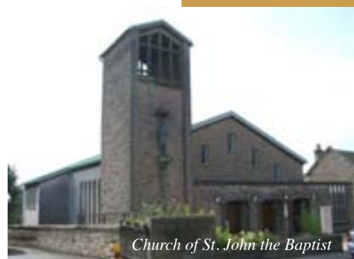
Church of St. John the Baptist

The old village core retains a considerable number of surviving vernacular buildings and much of its more recent infill development is domestic in scale, small in size, dispersed in location and though stylistically different, still incorporates a restricted palette of traditional materials. These buildings have an important role to play both as a backdrop or context to the listed buildings and in maintaining the village spatial structure. While there are significant examples of Victorian and Edwardian architecture on the boundaries of the Conservation Area, it is the mix in layout, respect for scale and use of vernacular treatment which helps to maintain a distinct village character. It serves as physical reminder of the Conservation Area's historic past and interest.