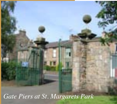
Gate Piers at St. Margarets Park