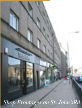
Shop Frontages on St. John's Rd

The effect of these developments was to tie the village more and more closely to the neighbouring city, making it practicable and inexpensive to commute from Corstorphine.