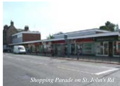
Shopping Parade on St. John's Rd

Following the First World War, the relative ease of commuting resulted in suburban sprawl, typified by bungalows set in relatively large gardens, which rapidly engulfed the village. Since the Second World War, the majority of development has occurred along the St John's Road shopping frontage. In the 1960s, new groups of shops were built at the corners of Manse Road and St John's Road, and Kirk Loan and St John's Road. Re-development on the north side of St John's Road has been more limited. This has established St John's Road as an important local shopping centre and left the historic core of Corstorphine relatively untouched. Corstorphine remains a popular residential suburb of Edinburgh, in no small part this is due to its ready access to the city and its connection with the west, the Central Belt and the countryside.