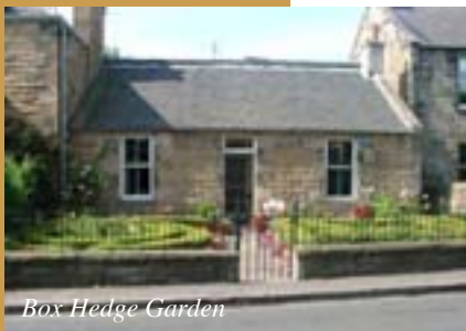
Box Hedge Garden

These contrasts are reflected by the relative tranquility of the High Street and by the often busy and congested St. John's Road. There are also differences in the types of views and vistas they each provide.