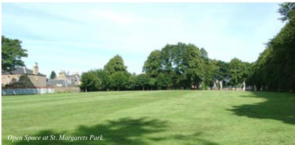
Open Space at St. Margaret's Park