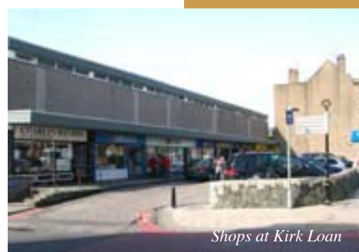
Shops at Kirk Loan

the small development of shops at the western junction of Kirk Loan which is set back with forecourt parking. The high Victorian Gothic spire and rose window of the Category 'C (S)' Listed St Ninian's Church is prominent in an elevated position on the northern side of the street, opposite Manse Road. Adjacent to it, and in distinct contrast with it, is the modern streamlined Church of St John the Baptist.