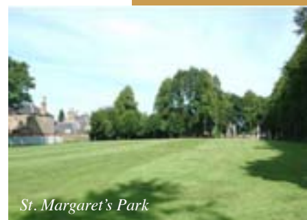
St. Margaret's Park

The High Street is also a much used through route for vehicles accessing the A8 and over Clermiston and Drumbrae to Queensferry Road and the Forth Road Bridge. The development of major retail sites in the vicinity attract visitors from far afield and have significantly increased traffic movements in the historic core of Corstorphine.