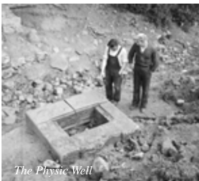
The Physic Well

In the 18th century, the village became popular as a fashionable summer spa resort for visitors attracted by the beneficial medicinal qualities of the Physic Well. Its reputation was such that in 1749 a regular stagecoach ran between Edinburgh and Corstorphine eight or nine times a day. However, the Well lost its medicinal properties and fell into disrepute around 1790.