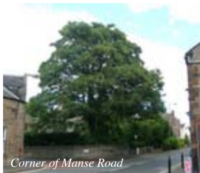
Corner of Manse Road

Some notable trees include the group of cedars at the corner of Manse Road and Corstorphine Road, the broadleaf at the corner of Manse Road and the High Street, which is of particular townscape value, and the line of mature trees and hedges on Dovecot Road, which partially screen and soften the front garden boundaries and provide screening.