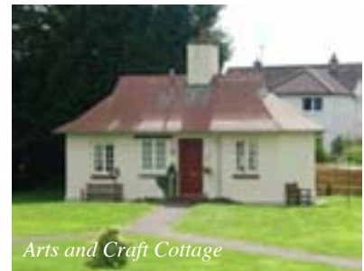
Arts and Craft Cottage

Murray Cottages at the western end of Ladywell Road are a picturesque assemblage of single storey, semi-detached Arts and Crafts cottages with bell-cast roofs grouped around an oval green. They are finished in harled brick with sandstone dressings and are Statutorily Listed (Category C (S)). The boundary treatment consists of coped sandstone walls to the north and west, railings to east, and fencing and hedging to the south.