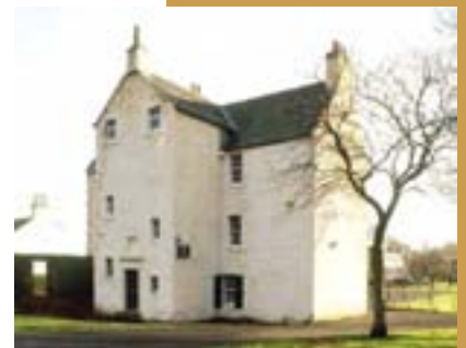
The Dower House

The Forrester family were also responsible for the construction of the mid-17th century Dower House, also known as Gibsone’s Lodge from it’s late 18th century occupants, which is set within the north east corner of St Margaret’s Park. The entrance gateway to the house is reputed to have been constructed from stone from Corstorphine Castle, which was demolished in the 18th century. It was badly damaged by fire in 1991 but has since been restored and is now occupied by the Corstorphine Trust, an organisation dedicated to the stimulation of public interest in the character, history and preservation of Corstorphine.