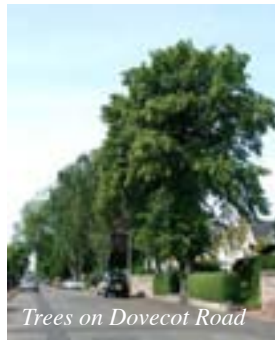
Trees on Dovecot Road