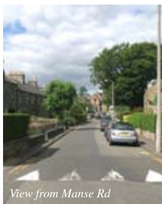
View from Manse Rd