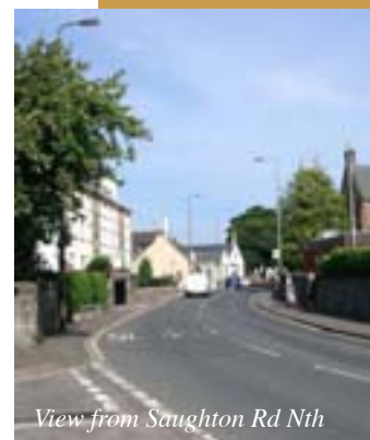
View from Saughton Rd Nth

The approach down Kirk Loan is still much as it looks in early views, a narrow road bound on one side by a high stone wall and on the other by trees with little room for the pavement which has been added. It is nowadays more typically lined with parked cars and these approaches are in constant use by traffic. This is one disadvantage of the location of Corstorphine's historic core despite the main east - west route and focus for shopping facilities now being concentrated on St. John's Road.