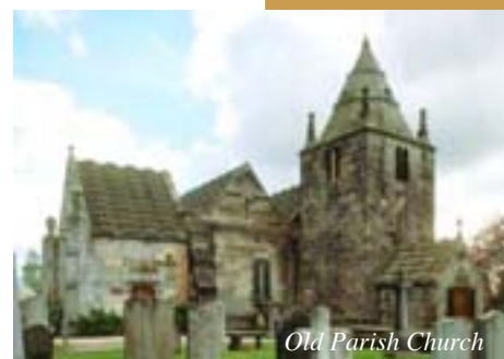
Old Parish Church

St Margaret's Park has a boundary to the High Street of cast iron railings on a low stone wall with robust rusticated gate piers surmounted by ball finials and a red tiled gate lodge at the main entrance.