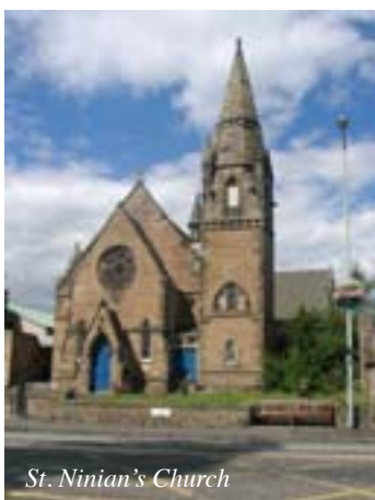
St. Ninian's Church

the small development of shops at the western junction of Kirk Loan which is set back with forecourt parking. The high Victorian Gothic spire and rose window of the Category 'C (S)' Listed St Ninian's Church is prominent in an elevated position on the northern side of the street, opposite Manse Road. Adjacent to it, and in distinct contrast with it, is the modern streamlined Church of St John the Baptist.