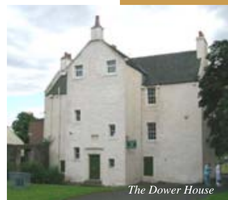
The Dower House