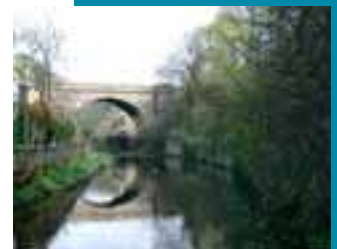
Water of Leith / Belford Bridge

The Water of Leith is an important amenity feature and recreational asset. The Water of Leith Walkway, created in the 1980/90s, provides an important recreational route linking the area with Leith and the Pentland Hills at Balerno. The walkway has links with other pedestrian and cycle routes through the Conservation Area forming important connections between open spaces across the city.