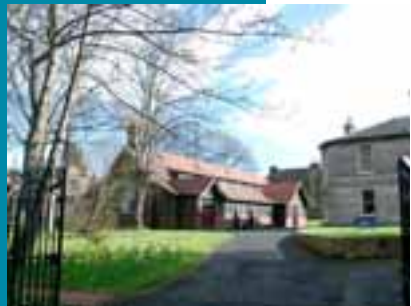
St Andrew's Church

St Andrew's Roman Catholic Church, at the junction of Edgehill villa and Ravelston Terrace was built of timber in 1902 as it was intended to be a temporary structure.