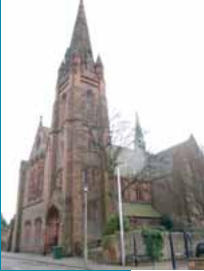
Dean Parish Church

Dean Parish Church at the north-west corner of Dean Path and Ravelston Terrace dates from 1902-3 and was designed by Dunn & Findlay. It is a cruciform plan Gothic church with a spired tower to the north east.