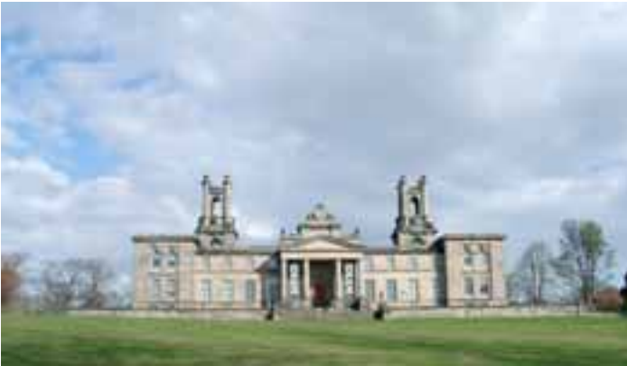
Dean Gallery Gallery of Modern Art