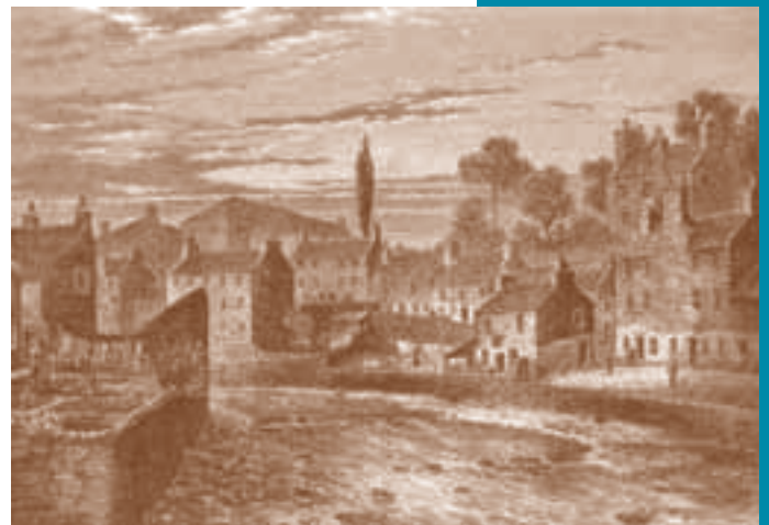
Water of Leith Village