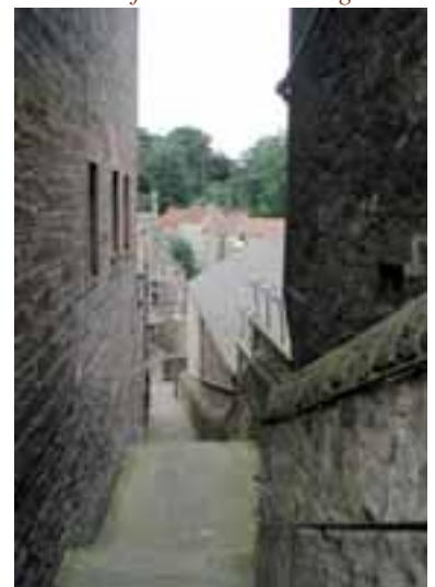
From Belford Road to village

Many of the roadways in Dean Village, Sunbury and Bells Mills are wholly or partly paved with setts, which provide a distinctive character. Convening Court is paved with stone slabs, as are parts of the footpaths in Dean Path and Bell's Brae. There are whin chips on one side of Dean Path. Elsewhere concrete slabs with substantial whin kerbs are the main street surface materials. Sunbury Place has good modern brick paving on both carriage-ways and footpaths. Beyond Belford Bridge, there are tarmac roads and concrete footpaths. The central courtyard in Well Court is finished with concrete.