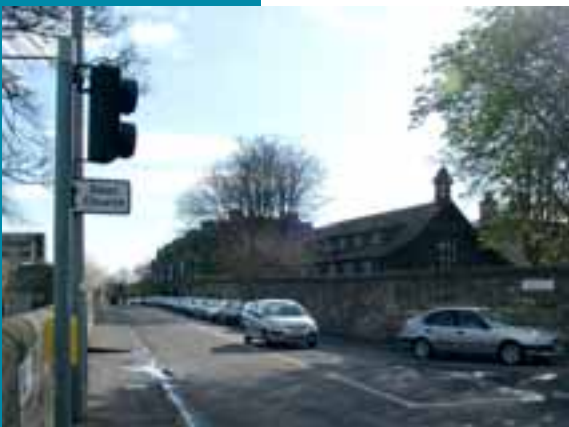
Dean Path / Ravelston Terrace

The Conservation Area has a distinct and complex character that makes it clearly identifiable within the context of Edinburgh. This character derives from both the history of the area and the topographical conditions. The area has interspersed development both in the valley and on the high ground, with high and low density. For example, a converted mill, mews and large detached villas. The street pattern is irregular, controlled by two routes across the river, one at Belford Bridge, the other at Bell's Brae/Dean Path. Ravelston Terrace (continued by Ravelston Dykes) and Belford Road link these two routes while other streets provide local access. Lanes, footpaths, footbridges and flights of steps allow pedestrians to circulate more freely.