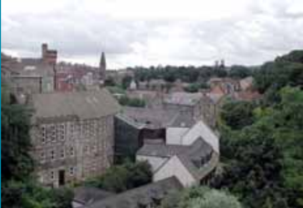
View west from the Dean Bridge