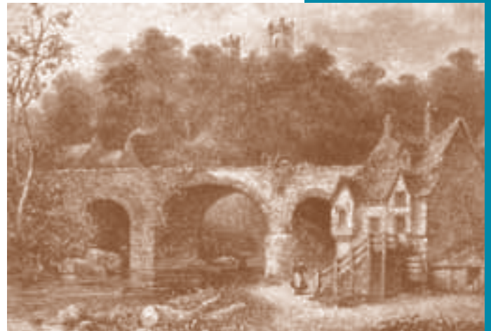
Bell's Mill Bridge

Belford Bridge was built by the engineers Blyth and Cunningham in 1885-7 to carry Belford Road, part of an old road from Edinburgh to Queensferry, over the Water of Leith at the site of an old crossing at Bell's Mills.