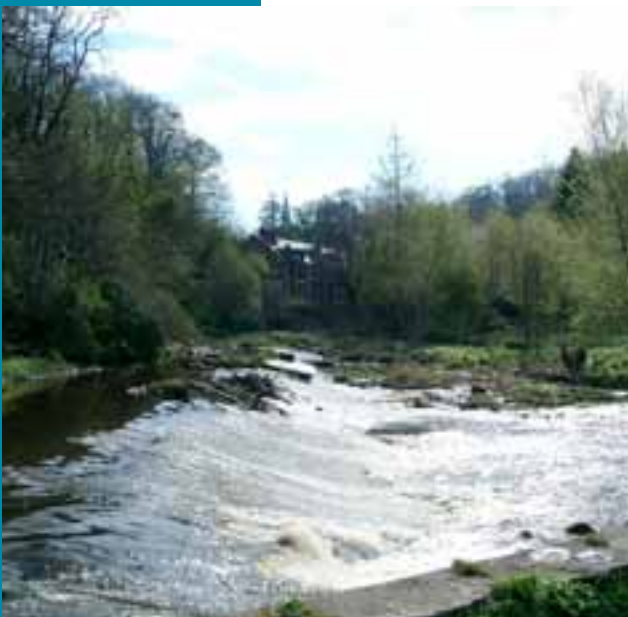
Water of Leith at "the Cauldron"

The Dean Conservation Area is particularly associated with the Water of Leith and Dean Village. It is set in a steep river gorge with lush vegetation and numerous trees. This creates a sense of enclosure and isolation to the settlements by the riverside. The ground rises sharply both to the north and south. The area to the north, which also forms part of the Conservation Area is a plateau with quite extensive formal green areas contained within the grounds of the Gallery of Modern Art, the Dean Gallery and St. George's School.