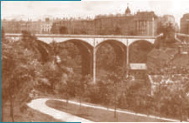
Dean Bridge c.1905