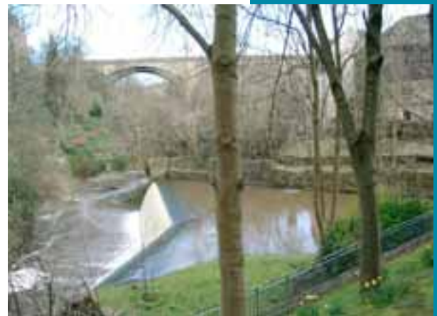
Water of Leith as it leaves conservation area

The 18th-century Water of Leith Bridge, at the centre of the Village, is rubble built with a single span. Across it, on the north side of the river, is West Mill which was built in 1805, and is considered the best surviving burgh grain mill in Scotland. It has four floors and an attic storey, and is solid and plainly constructed with a roundel carving of a wheatsheaf. In 1972, new floors were inserted for conversion of the building to flats. The symmetrically fronted Gothic inspired former Dean Board School forms a prominent feature on the north side of the river. Dating from 1874-5, it was converted into residential flats in 1985. Damside leads to the site of the former Tannery, demolished in 1976 and now replaced by harled flats and linked villas.