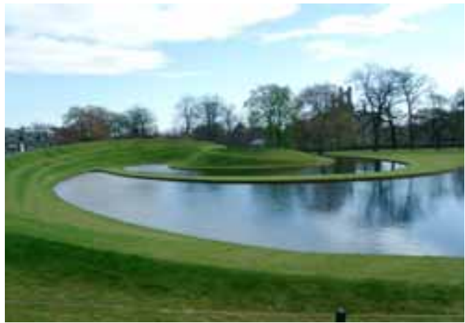
Gallery of Modern Art

The grand scale of the two Art Galleries is emphasised by their double entrances and the associated gatehouses. The Dean Gallery sits in an elevated position, taking best advantage of its view point. The Gallery of Modern Art faces the Dean Gallery, allowing the open green space at the front to connect with the design and layout of the green space associated with the Dean Gallery. Herbaceous planting frames the frontage of the Dean Gallery, whilst that of the Gallery of Modern Art is more open with its recently executed sculptured landform around an artificial lake. The deep tree belt, on the boundary of the Modern Art Gallery site adjacent to Belford Road, strengthening the open parkland element.