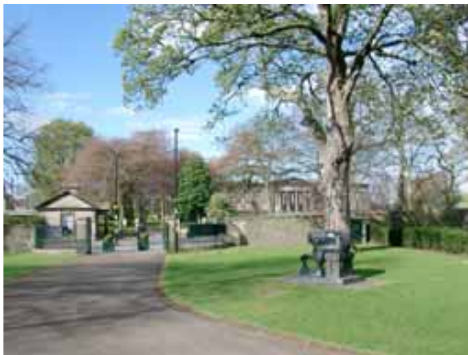
From Dean Gallery to Gallery of Modern Art

Moving uphill towards the plateau, there is the beginning of villa development and then the two art galleries set in extensive grounds.