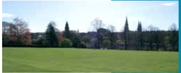
View south from the Dean Gallery

The higher ground of the Conservation Area is located on the edge of the city centre ridgeline where land falls away to the north towards the coast. Long distance views from Inverleith and Trinity towards the city centre pick up feature buildings and trees in the Conservation Area as part of the skyline of the city.