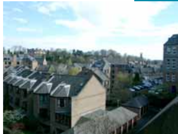
From Belford Bridge over Sunbury Mews

The core of the building stock derives from the late 18th and early 19th century. Dean Village's relative isolation lends a very distinctive character to the Conservation Area. It is the most accessible of all of Edinburgh's villages, located only a short walk from the West End. In Dean Village the buildings are mostly between three and five stories high and disposed in a picturesque manner on various levels with a distinctive roofscape. Sunbury is characterised by a series of mews buildings.