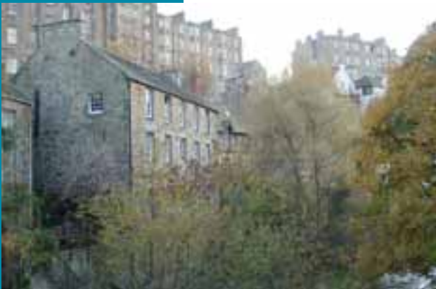
Views from Dean Path