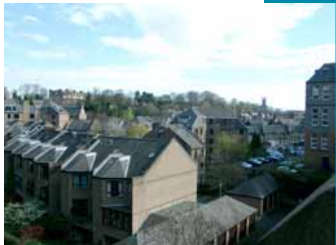
View from Belford Bridge

The Conservation Area is generally surrounded by 3 or 4 storey terraced houses and villas along with 2 large institutional buildings (Stewart’s Melville College and Donaldson’s College). About 40% of the Conservation Area boundary is characterised by a long narrow strip of green valley with dense vegetation and terraced gardens. This, along with the dramatic change in ground level sets the area apart and isolates it from adjoining areas particularly to the south and north east.