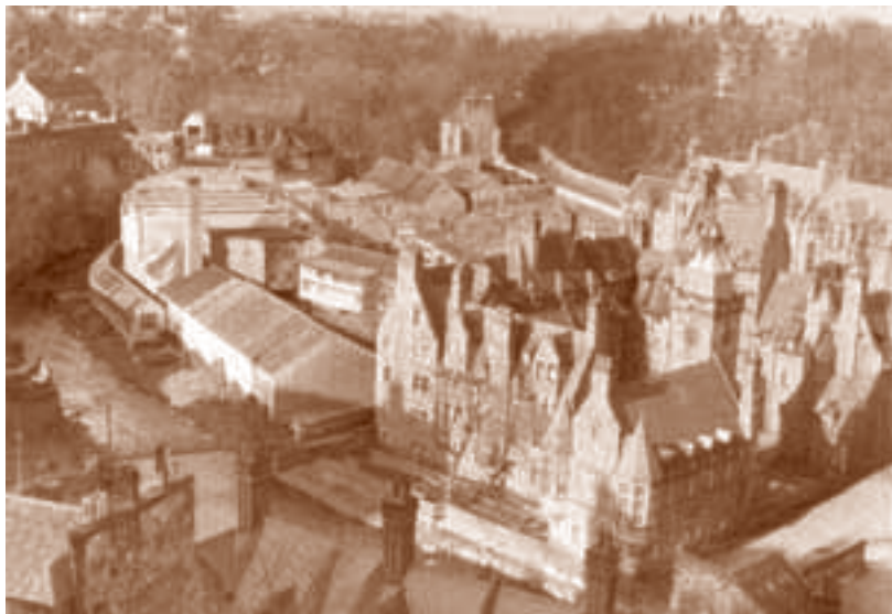
Aerial view of Dean Village c.1971