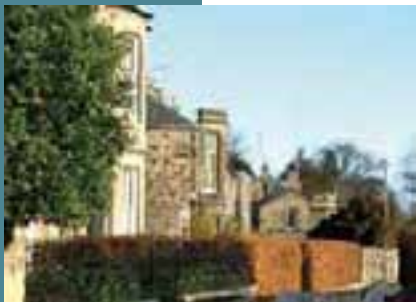
Old Church Lane

of amalgamation. In the middle section of the village, the plot sizes show least variation though there is a quite different character to development facing on to each of the two streets. On Old Church Lane are detached Georgian villas, set back from the road edge with front gardens that take advantage of their south facing aspect. In contrast development at the west end of The Causeway, the original route through the village, is more modest, terraced and set right at the heel of the pavement echoing more accurately the traditional vernacular of Scottish village architecture. On the south side of the street, three properties following the Sheep Heid Inn still retain a continuous frontage but are set back behind short front gardens before a high stone wall then continues on both sides to the end of the street. Detached houses are set behind these stone walls.