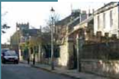
Old Church Lane