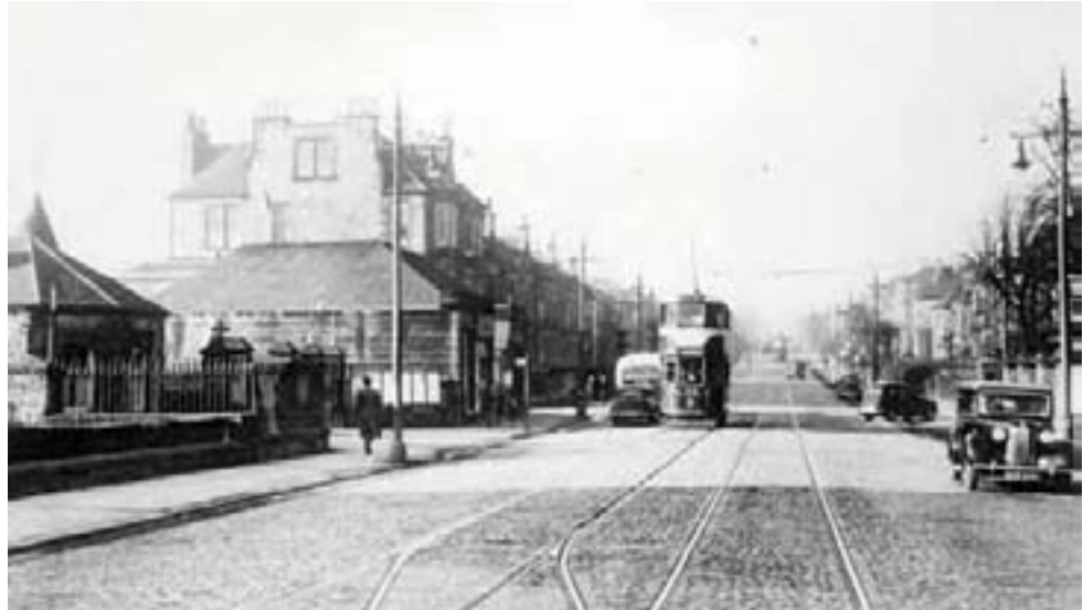
NEWINGTON STATION 1940's

On 10 September 1962, the suburban line was closed to passengers and consequently the stations at Gorgie, Craiglockhart, Morningside, Blackford Hill, Newington and Duddingston were closed. Today the suburban line remains heavily used for freight.