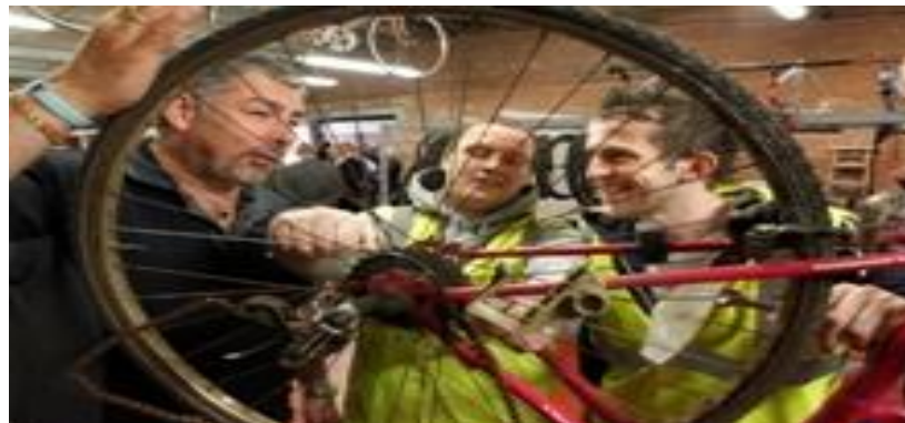
Sustainable Edinburgh 2020: Annual Report 2013-2014

On average 10 bicycles are repaired by 15-20 offenders per week. The project is currently concentrating on schools, with a target of 5 Edinburgh schools receiving 70 bicycles by the end of March under the "Schools for Bikeability" initiative. The project hopes soon to launch a SVQ qualification for offenders once staff training has been given and a suitable college course has been found. The project received funding from the Scottish Government's Payback Sports Facilities Fund.