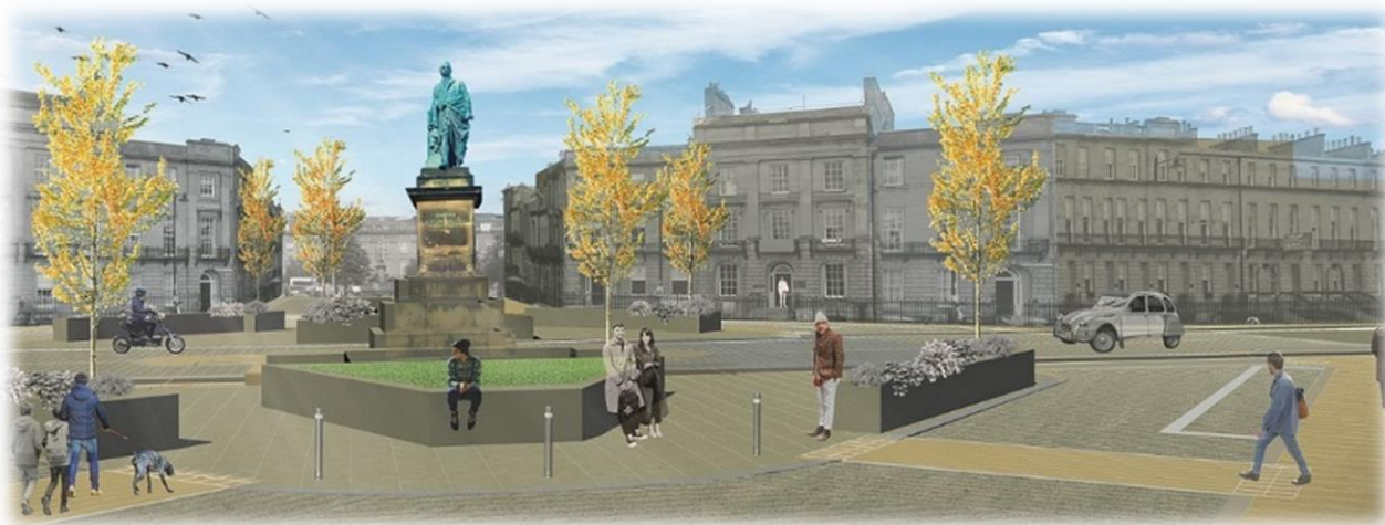
Figure 1: Visualisation for Melville Crescent Concept Design following Stakeholder Consultation