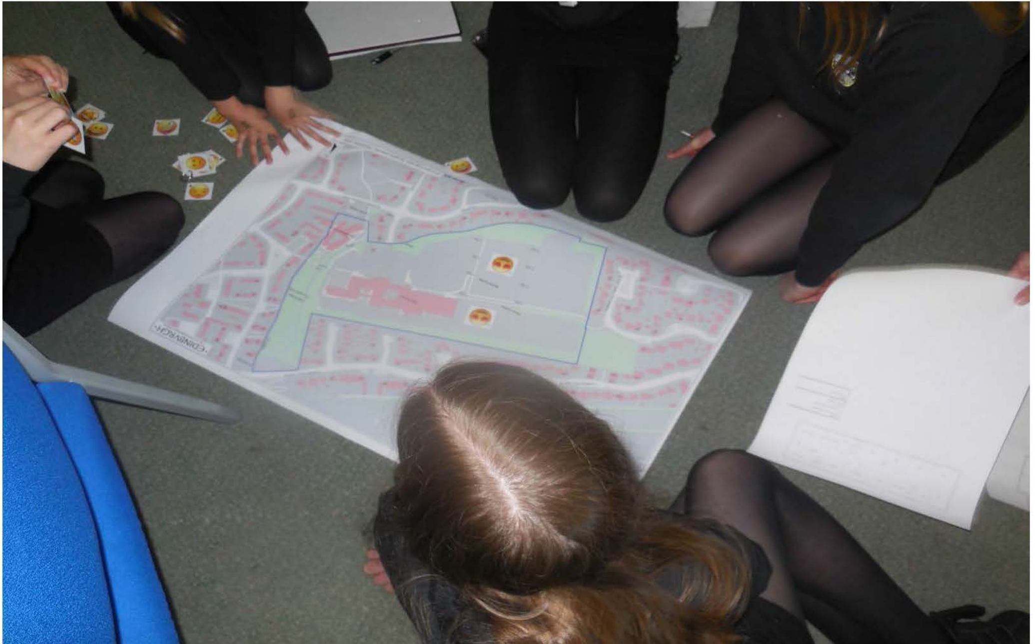
Pupils discussing the key issues for learners of the current school