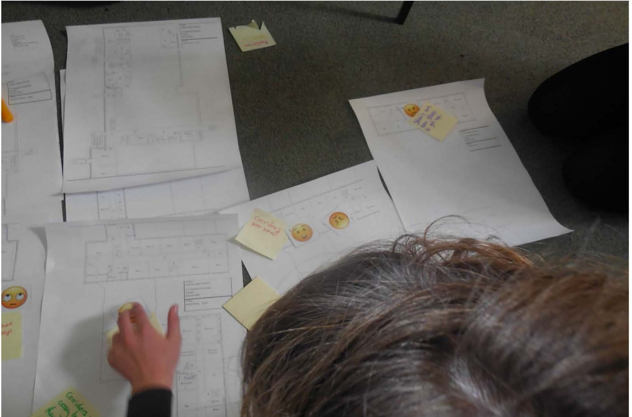
Pupils discussing the key issues for learners of the current school