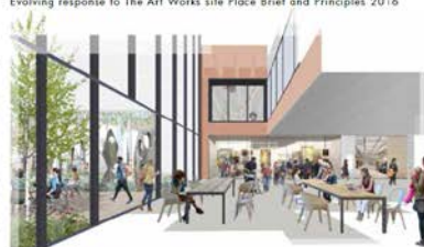
An open house for art