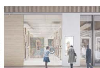
Opening up access to the national collection