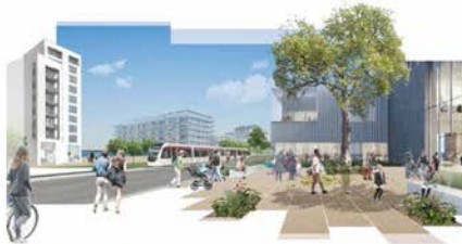
A shared public realm