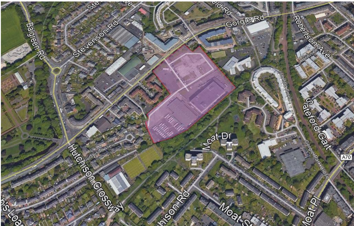
Figure 1: Detail of The Telereal site. This image approximates the Telereal ownership area, as highlighted, and local context. Approximately 3.2 Ha.

Telereal Trillium (TT) owns land at Gorgie, as indicated below (Figure 1), approximately 3.2 Hectares in area, fronting Gorgie Road to the north, residential to west, school, commercial and residential to the east and landscape/residential to the south.