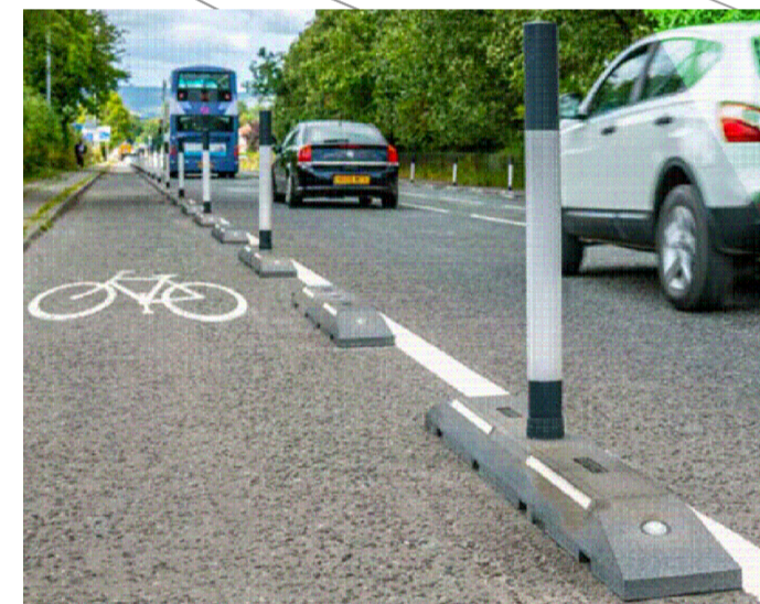
Fig 1. ROSEHILL NARROW CYCLE LANE DEFENDER UNITS - TO PROVIDE TRAFFIC SEGREGATION. PRODUCT 2.0m IN LENGTH & ARE BOLTED INTO CARRIAGEWAY WITH 5m GAP. NOTE CONTINUOUS WHITE LINING 1.8m OFFSET FROM KERB ON ROAD SIDE OF DEFENDER.