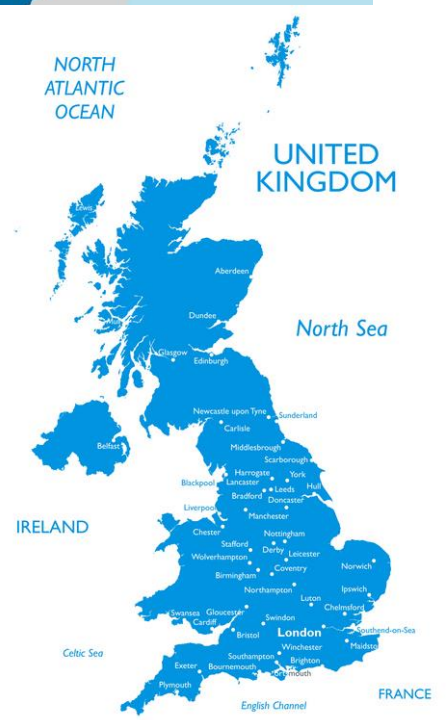
Maps used under licence to the City of Edinburgh Council