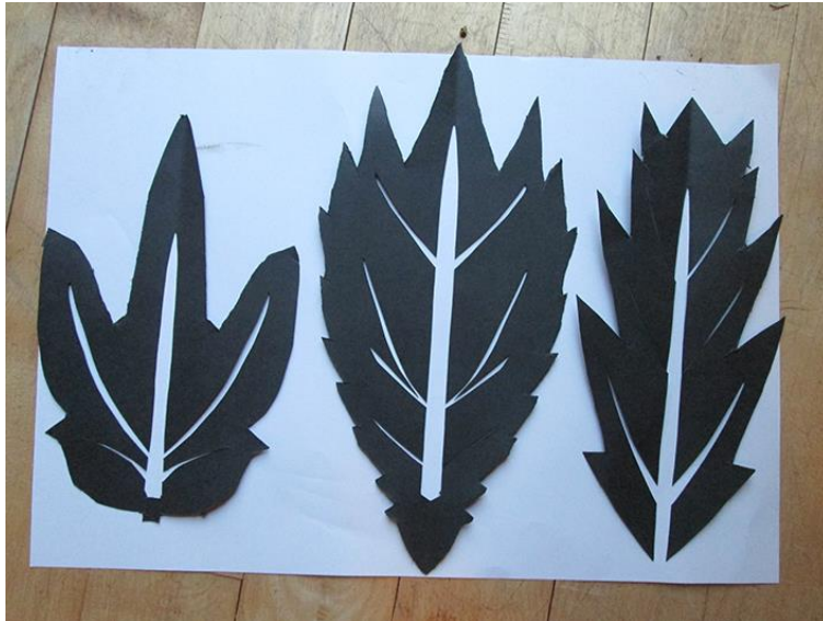
the black and white card silhouettes

lend themselves to translation in to laser cut steel.