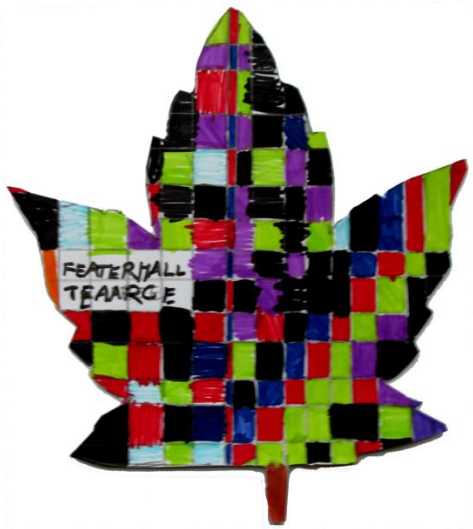
A distinctive street name designed by a P3 pupil