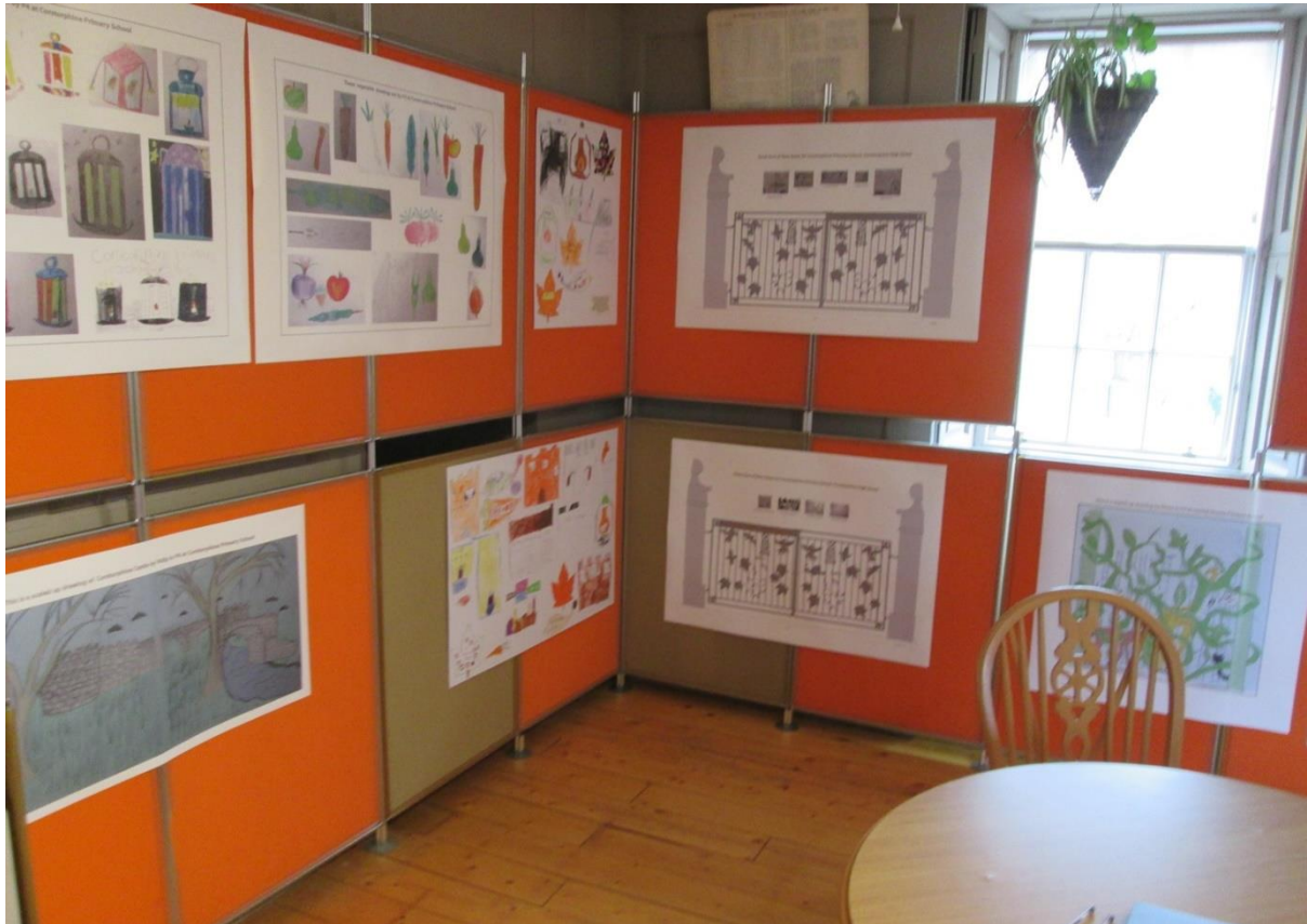
The exhibition in the Kilgour Room of the Dower House in St. Margaret's Park

The Corstorphine Community Trust and Community Council played a major role in facilitating the consultation process for the artworks. They provided exhibition space in the Kilgour Room of the Dower House for three weeks in March 2023 for the work by the children, and the designs that have evolved from this work, and publicised the exhibition via their mailing lists and social media. The Café staff in the Dower House Café also kindly played a key supporting role in promoting the exhibition and guiding visitors to it.