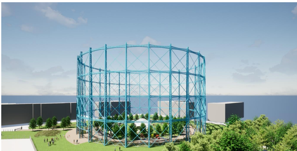
Visualisation of completed Gasholder – Full