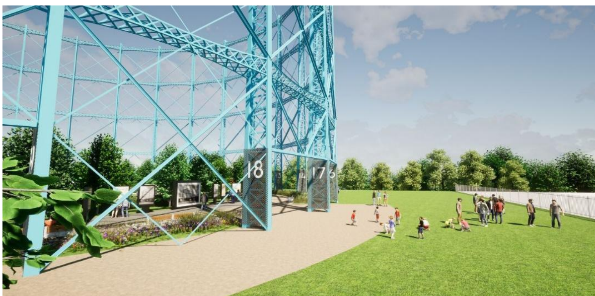
Visualisation of completed Gasholder – Section