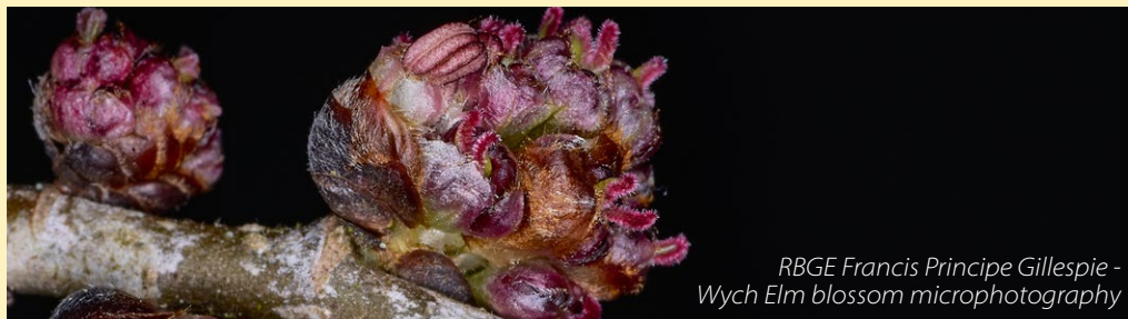
RBGE Francis Principe Gillespie - Wych Elm blossom microphotography