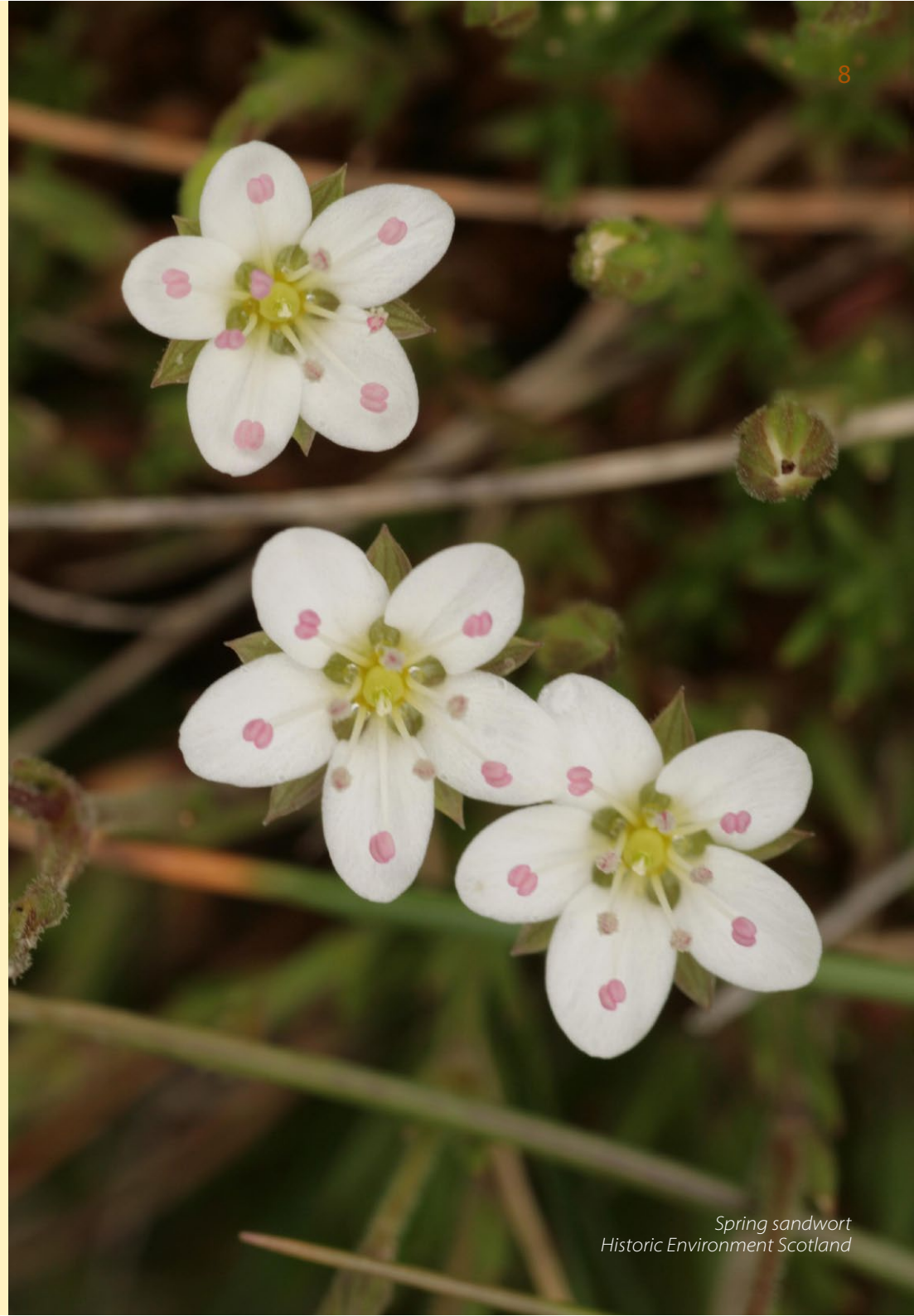
Spring sandwort

City of Edinburgh Council signed the 'Edinburgh Declaration', which was developed when the Scottish Government held a meeting for Post 2020 Global and Sub-national Biodiversity Targets in May 2020. The most recent global initiative for cities, the Berlin Urban Nature Pact, was launched at COP 16 in October 2024 and the Edinburgh Biodiversity Partnership are taking a leading role in exploring the opportunity for Edinburgh to sign this pact.