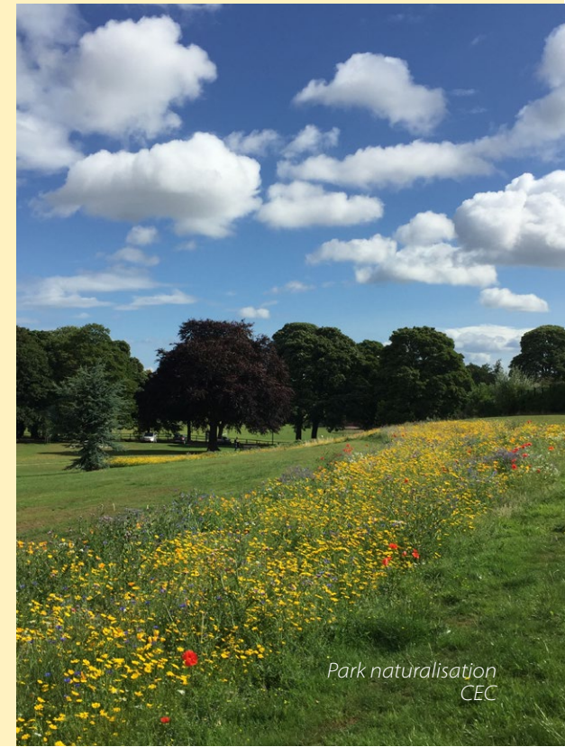
Park naturalisation CEC