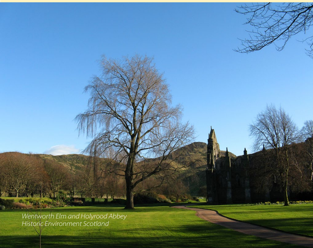
Wentworth Elm and Holyrood Abbey Historic Environment Scotland