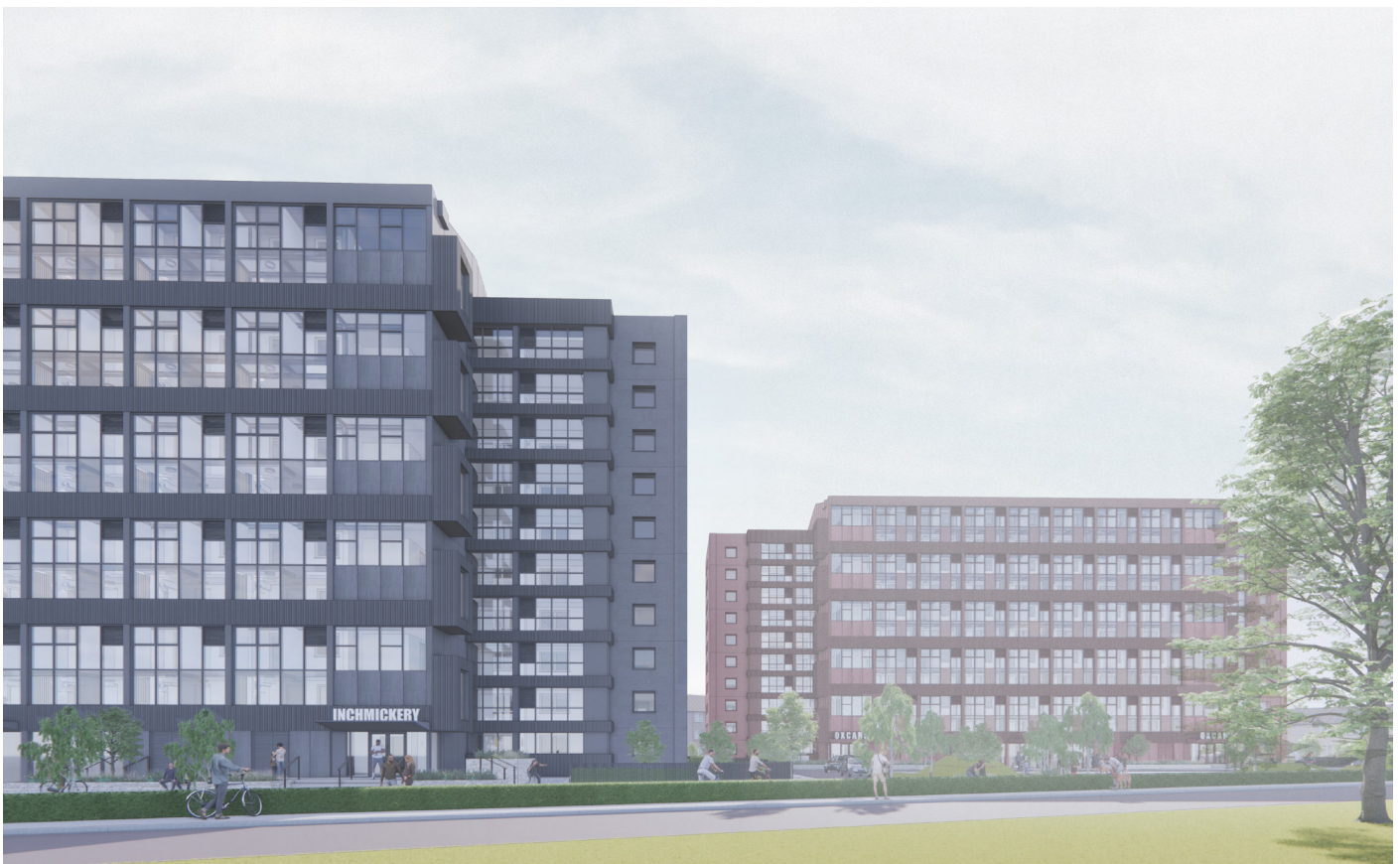
View of the proposed works to Inchmickery & Oxcars

This means that all residents will have to move to alternative accommodation until the work is complete. The work will start in Inchmickery Court, then when the works there are complete, we will move on to Oxcars Court.