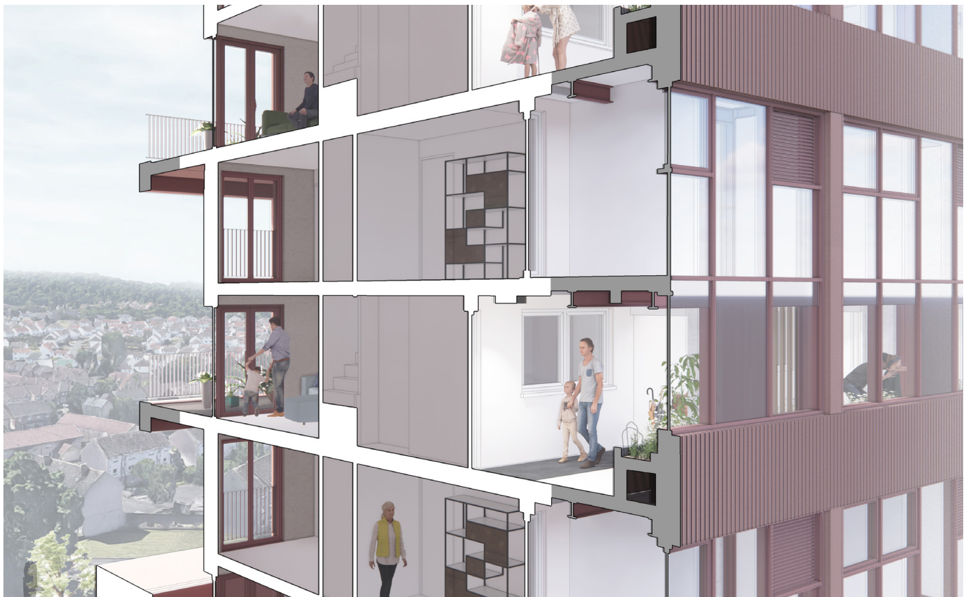
Section through the extended Access Decks

As well as the original upgrades (see Newsletters 01 - 06), for every flat we also plan to: