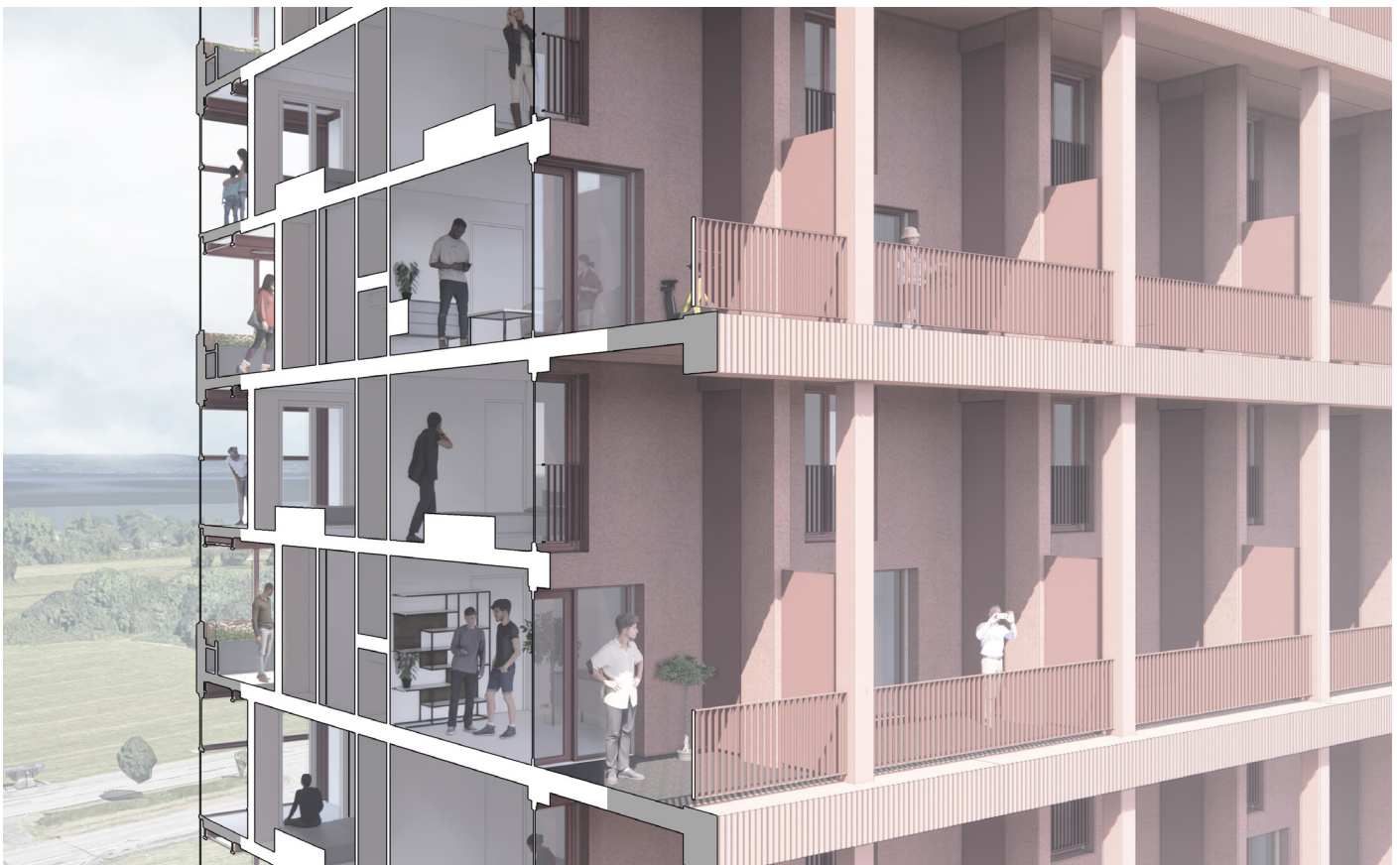
Section through the extended Balconies