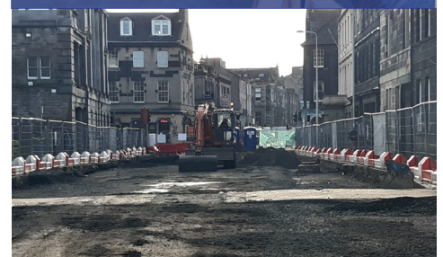
Queen Charlotte St to Baltic St