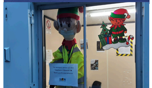
Logistic Hubs festive hours