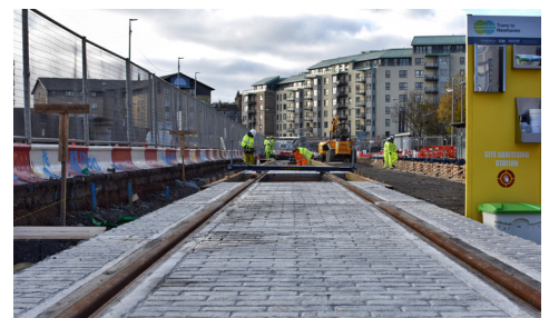
Track installed at Ocean Terminal