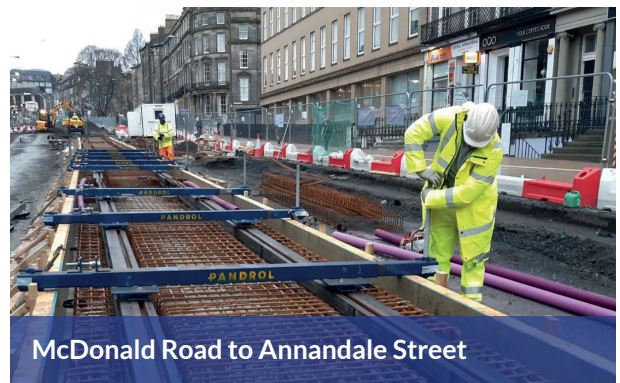
McDonald Road to Annandale Street

The main infrastructure works are progressing well with the sequence of track works continuing. Works are progressing with both inbound and outbound track installation.