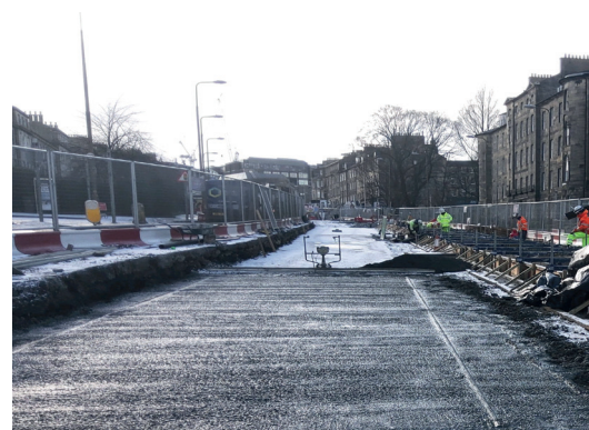
McDonald Road to Annandale Street