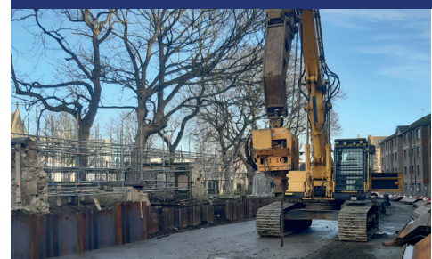
Coatfield Lane to Laurie Street