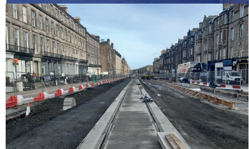
Annandale Street to McDonald Road