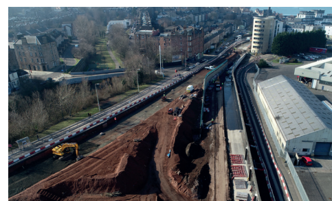
Newhaven to Melrose Drive

This area has been handed over from MUS to SFN who will commence drainage and ducting works followed by the main infrastructure works. This area is due to be completed in summer 2021 and will then be followed by works on the road.