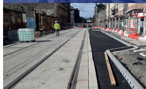
Constitution Place to Baltic Street