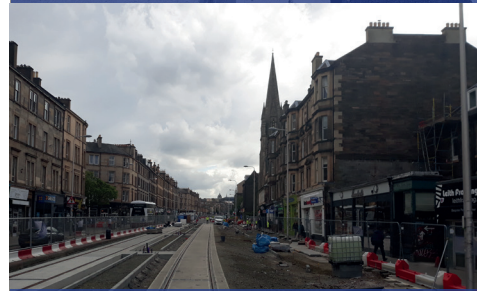
Dalmeny Street to Pilrig Street