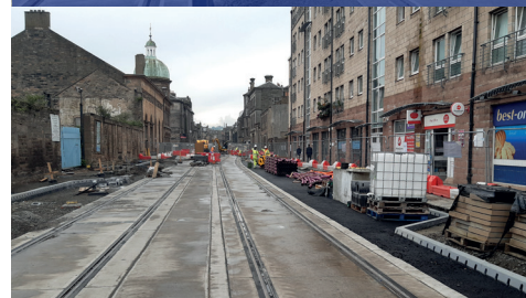
Constitution Place to Baltic Street