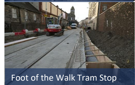
Foot of the Walk Tram Stop