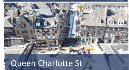
Queen Charlotte St