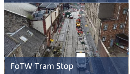
FoTW Tram Stop